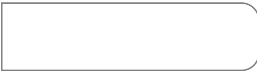
Round Pencil Edge Adjustments to the radii can be accommodated