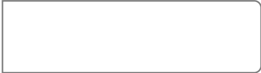
Natural Tumbled Edge Simple yet stylish