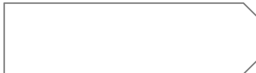
Bevel Top & Bottom A sleek modern look.